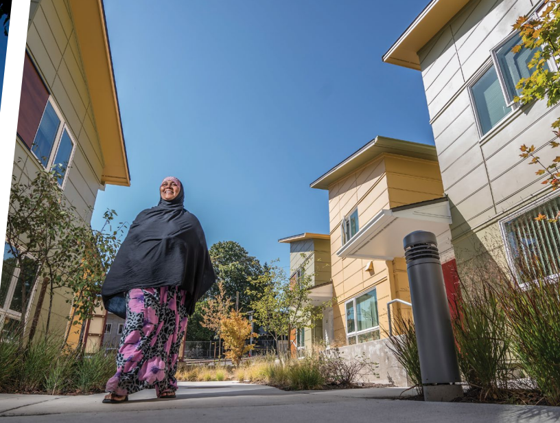
Bay Area Affordable Housing Pipeline, May 2024